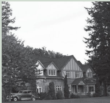
Main house, 1952.

At the Brooksdale Environmental Centre here in south Surrey, our commitment is to the care of the Tatalu River watershed (Little Campbell River), which runs through the property. There are three core program areas: conservation science, environmental education, and sustainable agriculture . Within and around these programs, there are also conservation residents (formerly known as the internship program) along with retreats and hospitality through the Guest House.