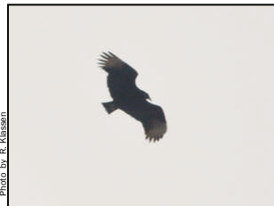
Black Vulture in the Pembina Valley

position of its wings during soaring flight.